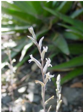
H. truncata flowers