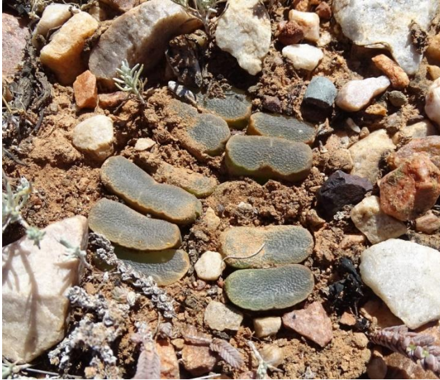
H. truncata var. truncata near Calitzdorp

Haworthia truncata (Schoenland 1910) AKA: horse teeth, perdetande Distributed in the eastern Klein Karoo. The plants bloom in late winter to early spring. Flowers are born on an up to 200mm inflorescence. They are white with brownish veins. The plants are found in locations throughout the eastern part of the Klein Karoo, with very large populations east of Oudtshoorn.