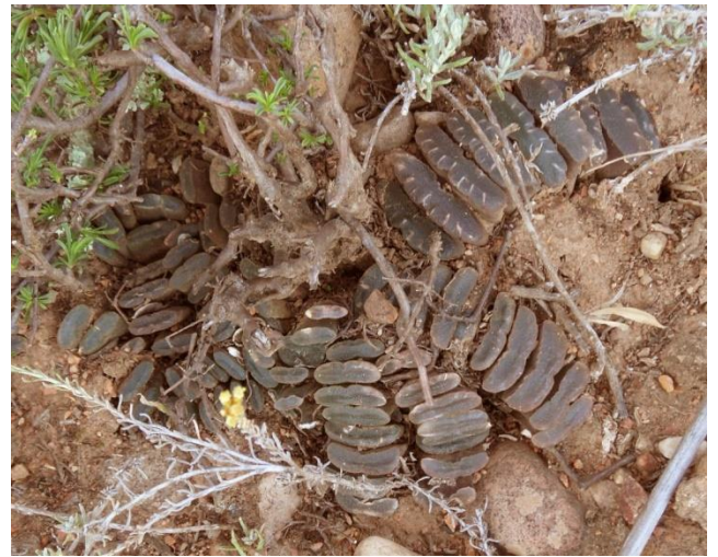
H. truncata var. truncata near Dysltdorp

H. truncata var. truncata grows in a distichous (fan shaped) form. The leaves are quite fleshy growing in a single flat shaped (distichous) rosette. Most of the plant is growing below surface. We see only the ends (windows) of the leaves. The ends are elongated with shapes varying from squared off edges to rounded ends. We have a number of populations in the Calitzdorp area.