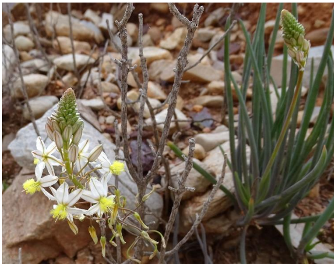
Bubine frutescens is one of 5 Bulbine species endemic to the Klein Karoo.