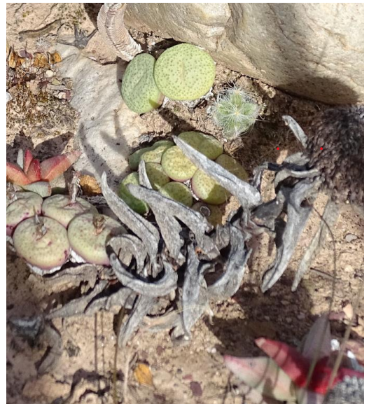
Conophytum minimum and Crassula congesta are often found together. Note the seedling Crassula barbata .