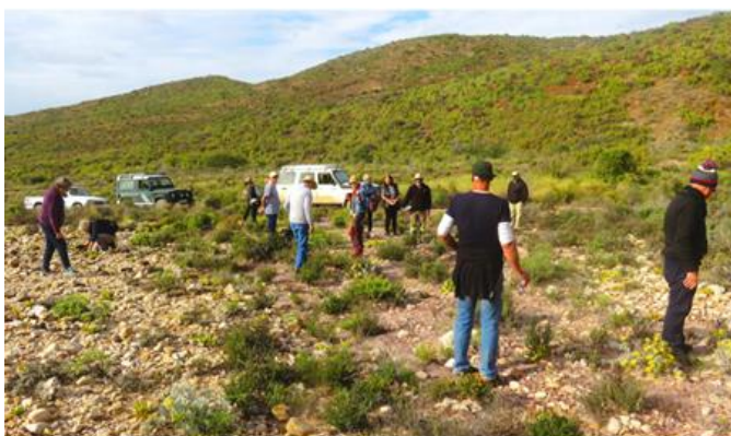
Our group admiring the succulent plants and bulbs. Note the amazing green hills!

Here are some photos from our day in the veld.