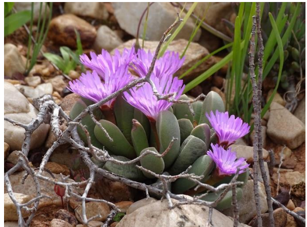
Cerochlamys pachyphylla is a single species genus endemic to the Klein Karoo.