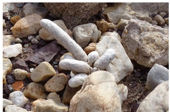
Anacampteros papyracea camouflaged in the white quartz.