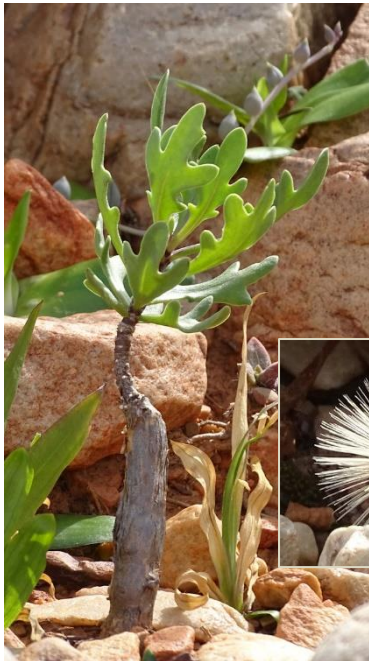
Othonna retrofracta has a very interesting, if short-lived, flower.