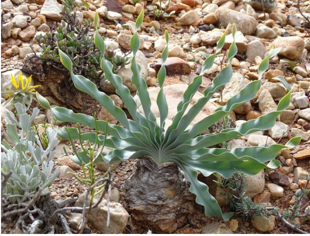
A magnificent Boophone distica – between 10-20 years old. Bloom will arrive in the summer.