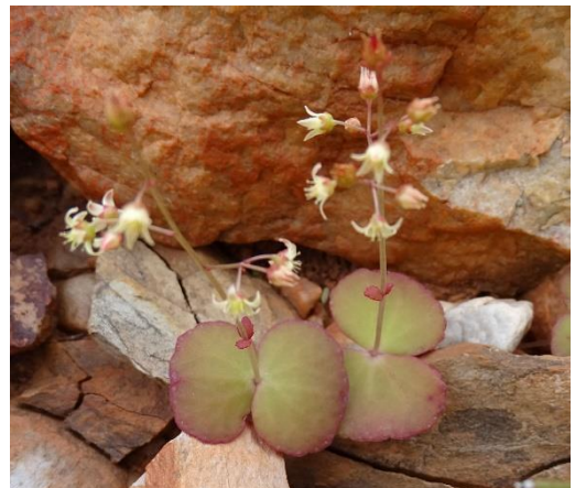
These delicate Crassula umbella only appear in years with abundant rain.