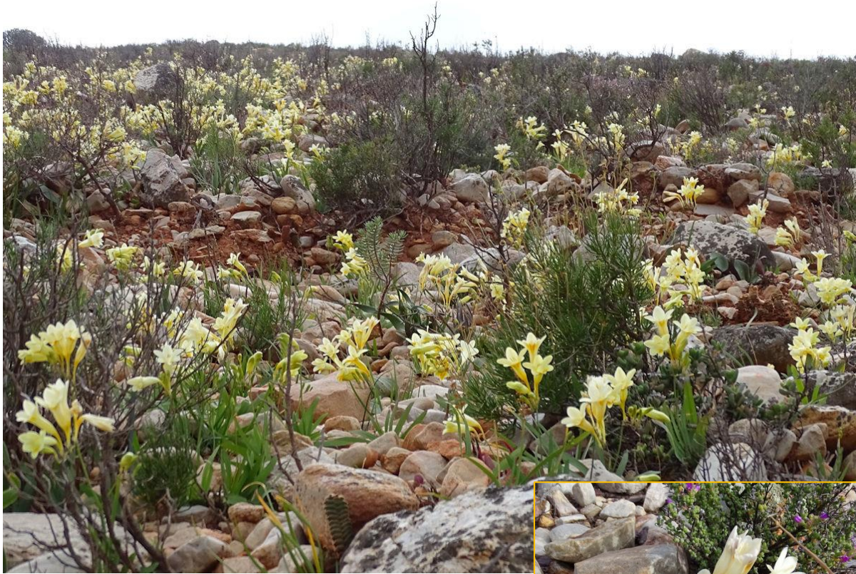
The hills were lemon-scented with millions of Freesia speciosa .