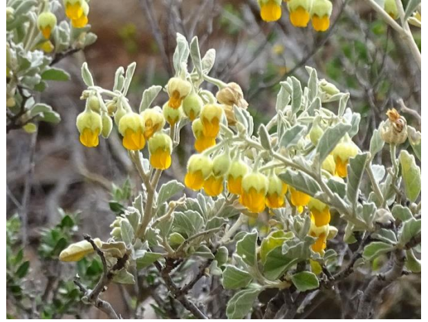
Hermannia odorata decorates the edge of the trail.