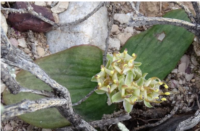
Massonia depressa reaching out with pollen-filled stamens to attract pollinators.